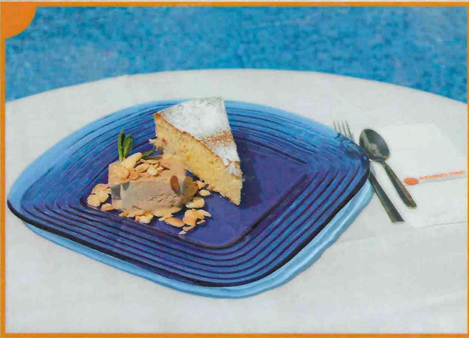
GATÓ CON HELADO DE ALMENDRAS 4.70 €