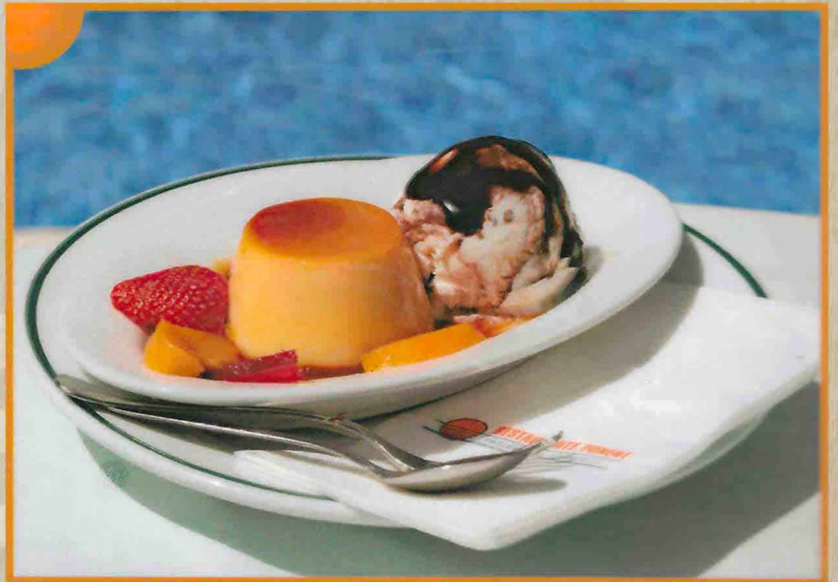
FLAN CON HELADO 3.40 €