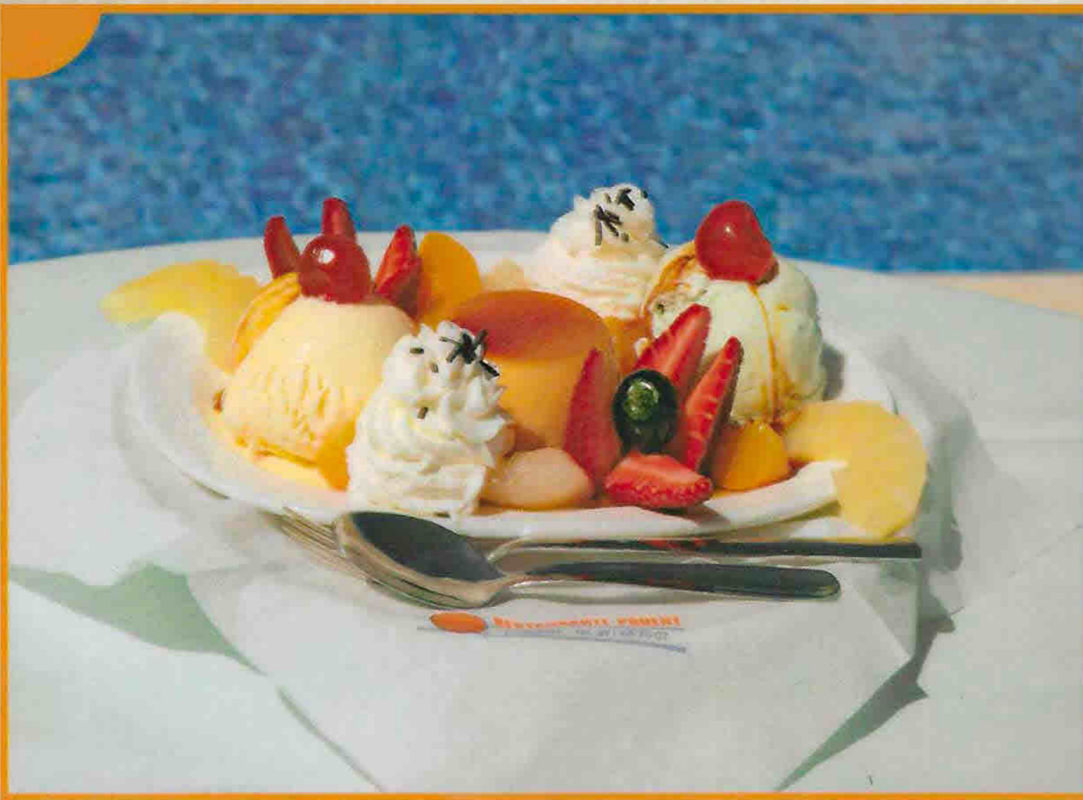
PIJAMA 5.80 €