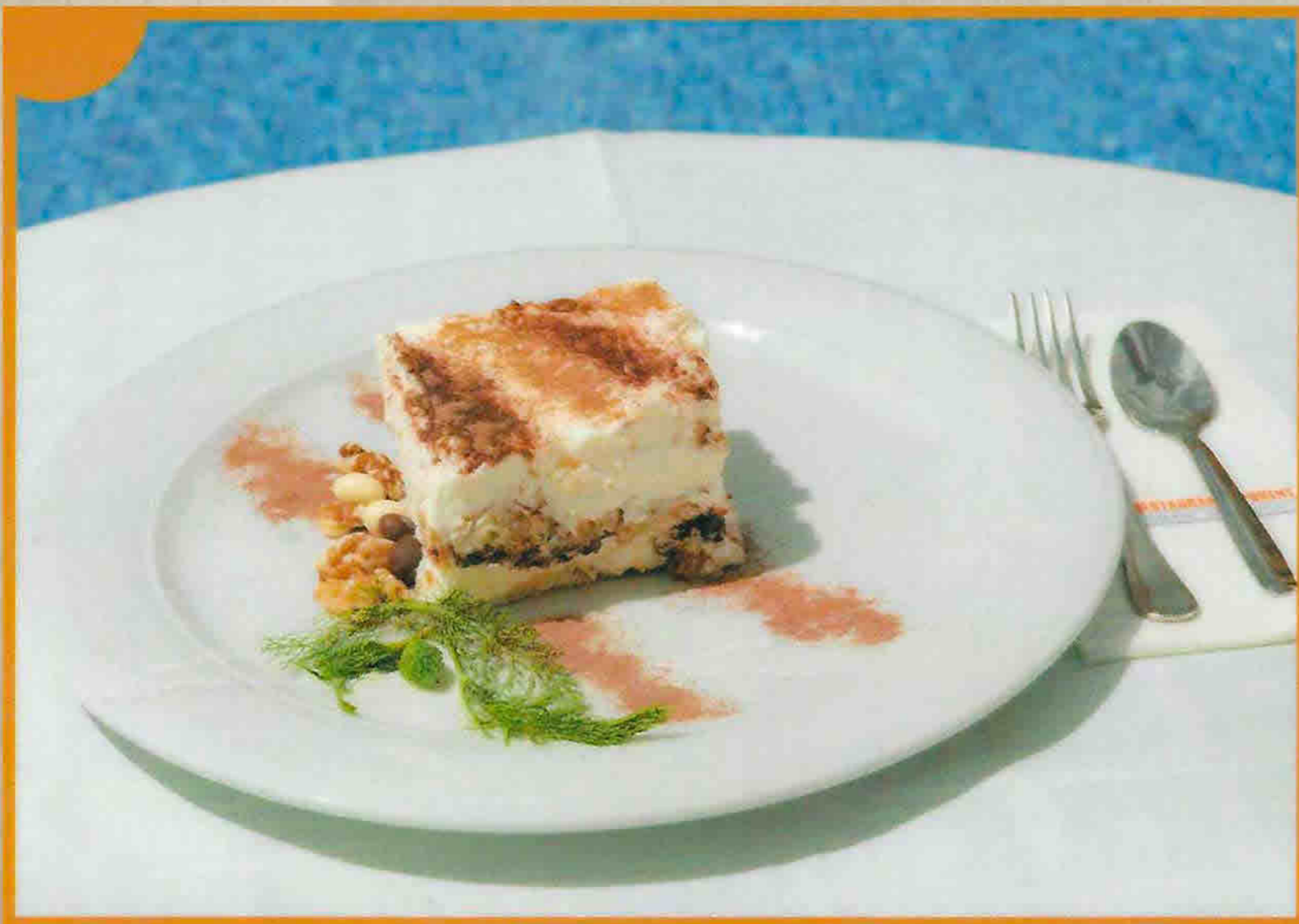
TIRAMISÚ 4.60 €